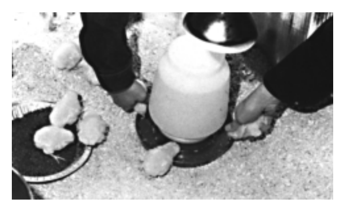
Water, feed and a heat source are all essential in getting chicks off to a good start.

Optimum performance is dependent on proper nutrition. The feed dealer should be informed of the type of feed required at least 2 weeks before chicks arrive so that fresh feed can be ordered. It is absolutely essential that birds receive a high-quality poultry