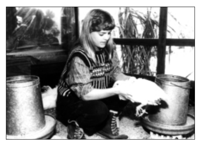
Handle birds carefully. Keep feeders and waterers level with the back height of the birds.

Snub the top beaks of birds if feather picking or cannibalism starts. Trim one-third of the upper beak with an electric beak snubber. Vicks<sup>®</sup> salve or an anti-peck compound applied to the bloody pecked