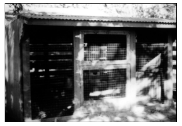
A typical building used for growing broilers or roasters for a youth project.

Be prepared for the chicks 2 days in advance. Put at least 4 inches of litter on the floor of the cleaned, disinfected house. Wood shavings, cane fiber, coarse