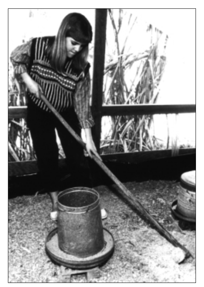
Stir the litter daily to prevent packing. Damp or caked litter will cause health problems and affect bird performance.

dry sawdust, peanut hulls or rice hulls make good litter. Hay makes very poor litter. Keep all sticks, boards and sharp objects away from the broiler house.